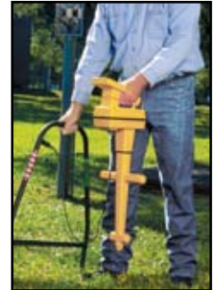
3M™ Dynatel™ Cable/Pipe and Fault Locator 2273M

The receiver also accommodates four user-definable auxiliary frequencies and allows the user to perform a self-calibration operation at any frequency at any time. With the easy-to-use configuration tool, users can enable or disable any of 22 frequencies.