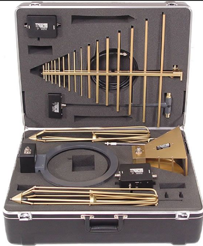
Shown with optional preamplifiers