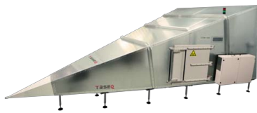
GTEM 1250, door right side

A GTEM (Gigahertz Transverse Electro Magnetic) cell is a test site for efficiently performing both radiated immunity and emissions testing in a single, controllable and shielded environment. Compared to other test sites, GTEM testing is faster with high accuracy and excellent reproducibility.