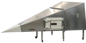
GTEM 750, door right side

A GTEM (Gigahertz Transverse Electro Magnetic) cell is a test site for efficiently performing both radiated immunity and emissions testing in a single, controllable and shielded environment. Compared to other test sites, GTEM testing is faster with high accuracy and excellent reproducibility.