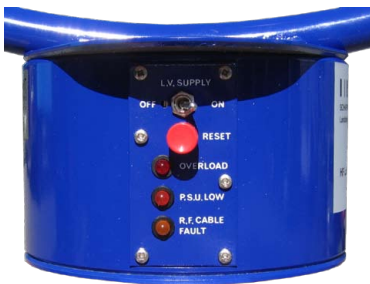
HLA 6120, view to the panel