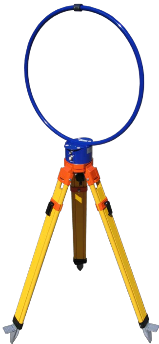
HLA 6120 onto tripod CTP 6099