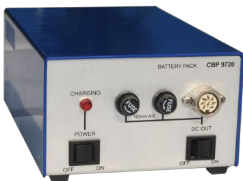
CBP 9720 (battery pack and power supply)