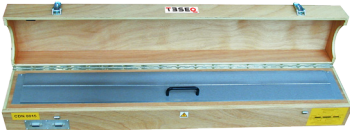
CDN 8014/8015, Coupling clamp according to IEC 61000-4-4