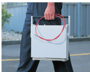
NSG 3025, portability for On-Site use

The automated operation of the NSG 3025 offers the certification engineer time saving and professional functions while occupying very little space. It performs pre-programmed tests to EN 61000-4-4 and various product standards with faultless reproducibility. Coupling mode selection and power to the EUT are all under program control. Execution of the automated tests and production of the test reports can be via computer running under Windows based software control. A 3-phase extension facility and an attenuator for periodic pulse verification purposes are also available.