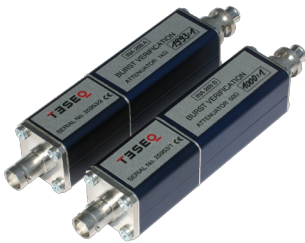
CAS 3025, Calibration set for Burst