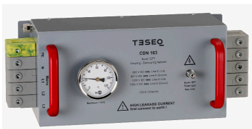
CDN 163, Burst Coupling Network 100A per channel