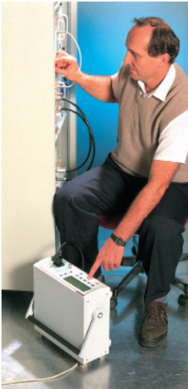
NSG 3025, portability for On-Site use