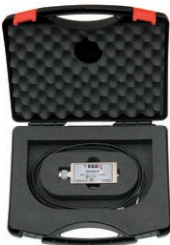
PMU 6003 in storage case