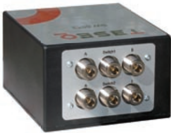
SW 6012 front view