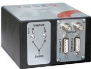
SW 6012 back view

The SW 6012 adds two SPDT switches to the built-in switching network of the ITS 6006. It is fully powered and controlled by the ITS 6006. Interlock connections are provided for switching the amplifier gain on/off. Additionally the SW 6012 is supplied with a second user port socket for various applications.