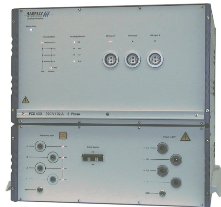
PCD 130 Three Phase Power Line CDN