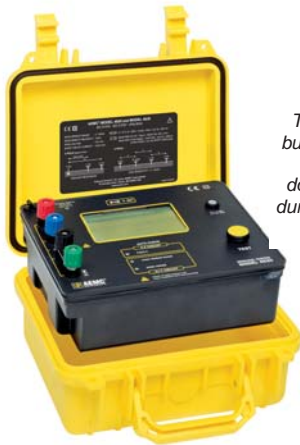
The Models 4620 and 4630 are built into a double case. This extra rugged construction provides double insulation, maximum field durability and ease of serviceability.