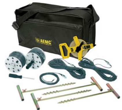
Test Kit – 4-Point includes carrying bag, two 300 ft color-coded leads on spools, two 100 ft color-coded leads, four 16" auxiliary ground electrodes, one 16 ft lead with Mueller® clip and one 100 ft tape measure Catalog #2130.63