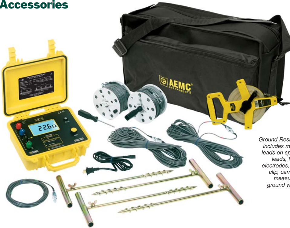
Ground Resistance Tester Model 4630 Kit includes meter, two 300 ft color-coded leads on spools, two 100 ft color-coded leads, four 16" auxiliary ground electrodes, one 16 ft lead with Mueller® clip, carrying bag, one 100 ft tape measure, one AC power cord, ground workbook and user manual