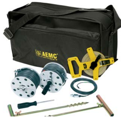
Test Kit – 3-Point includes carrying bag, two 150 ft color-coded leads on spools, two 16" auxiliary ground electrodes, one 16 ft lead with Mueller® clip and one 100 ft tape measure Catalog #2130.62