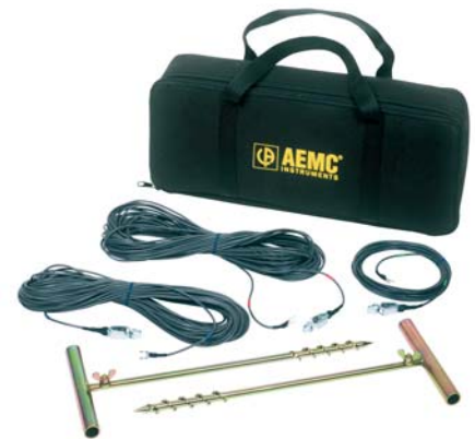
Ground Test Kit – 3-Point (supplemental 4-Point) includes carrying bag, two 100 ft color-coded leads, one 16 ft lead and two 16" auxiliary ground electrodes Catalog #2130.61