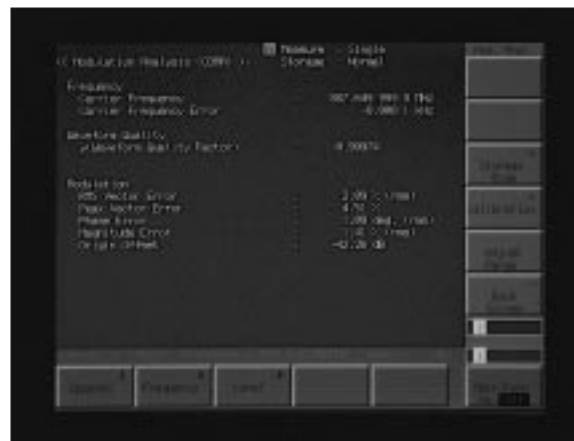
CDMA modulation analysis