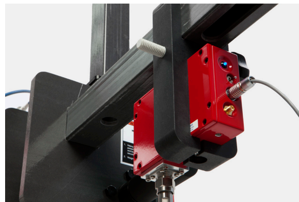
The Model 3142E-PA pre-amplifier features a bright LED light, allowing for easy visual detection of pre-amplifier operation when unit is mounted onto an antenna tower.