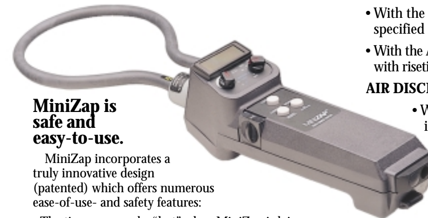
MiniZap with Model MZT-12 H-Field Simulation Tip.

And MiniZap is the only simulator which can be powered by either AC or built-in rechargeable batteries.