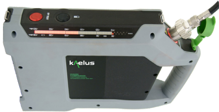
Passive Intermodulation (PIM) Analyzer

The iHA series “Companion” Passive Intermodulation (PIM) analyzer is designed to complement the iQA and iMT series high power PIM test solutions. This low power, highly portable analyzer is an ideal tool for identifying PIM performance issues in difficult to access locations. As with all low power PIM analyzers, the iHA series is not intended for system level site certification.