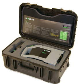
Portable transit case for analyzer and accessories.

Record data directly to laptop using interface cable and software.