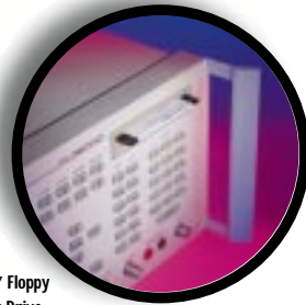
3.5" Floppy Disk Drive

All manual screens have soft keys to help technicians maneuver through comprehensive test screens. Operating an extensive test or improving response time is enhanced using the soft keys.