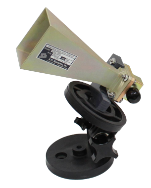
* pictured mounted on an AEH-510 Tripod head

This Standard gain horn antenna has medium gain, low VSWR, and a constant antenna factor; excellent for both immunity and emissions testing.