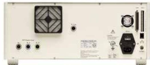
AXOS 5 rear view