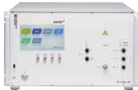
AXOS 8 Ring Wave Test System Article no. 2490820

Surge 1.2/50µs...8/20µs IEC/EN 61000-4-5