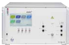
AXOS 8 Dips Test System Article no. 2490840

Surge 1.2/50 \mu s...8/20 \mu s IEC/EN 61000-4-5